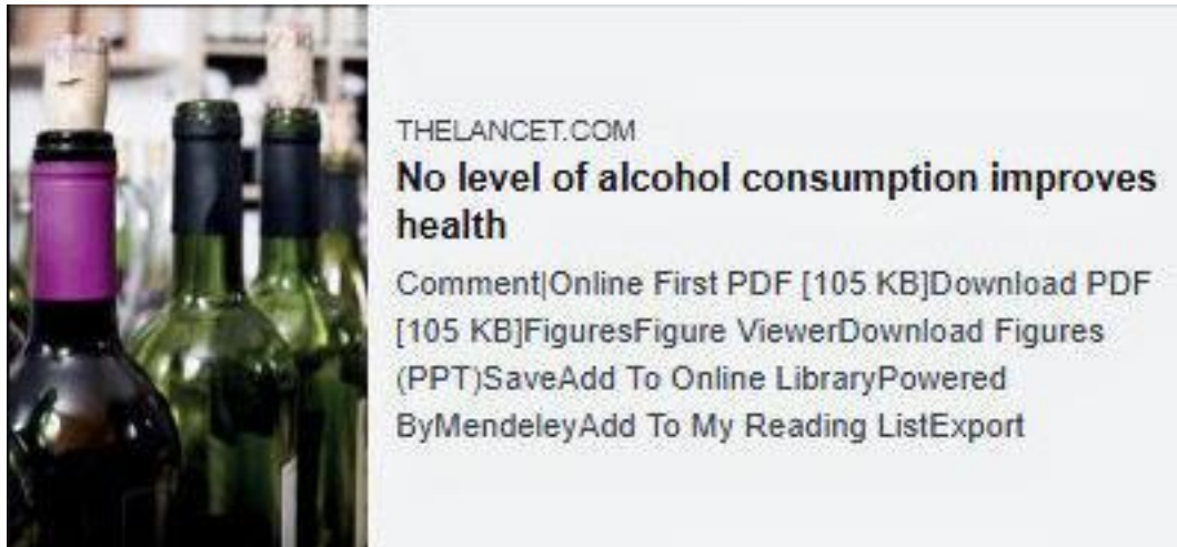
Image 1: “No level of alcohol consumption improves health.” “The conclusions of the study are clear and unambiguous: alcohol is a colossal global health issue and small reductions in health-related harms at low levels of alcohol intake are outweighed by the increased risk of other health-related harms, including cancer.” “There is no safe level of alcohol consumption.” Wikipedia: The Lancet is a weekly peer-reviewed general medical journal. It is among the world’s oldest, most prestigious, and best known general medical journals.” Online, the image links to the article. https://www.thelancet.com/journals/lancet/article/PIIS0140-6736(18)31571-X/fulltext